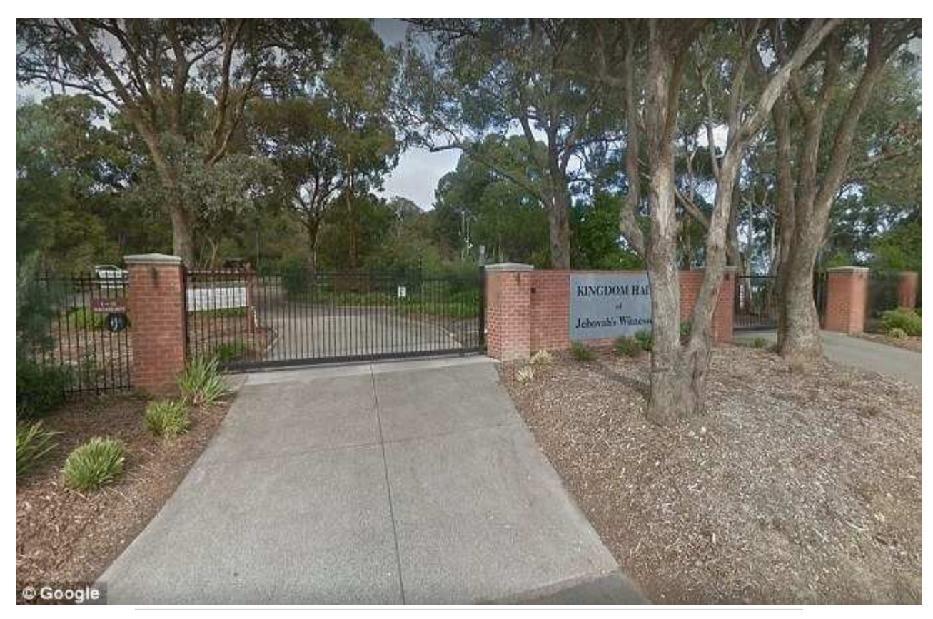
Richard Hill, a church patriarch at Jehovah's Witnesses in Plenty, north-east of Melbourne (pictured), convicted of sexual assault is now free and once again working with children