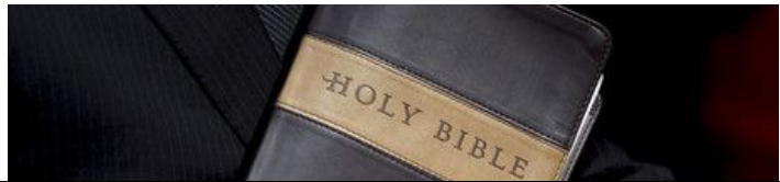
Russian court sentences Jehovah's Witness for re