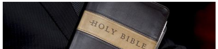
Russian court sentences Jehovah's Witness for re