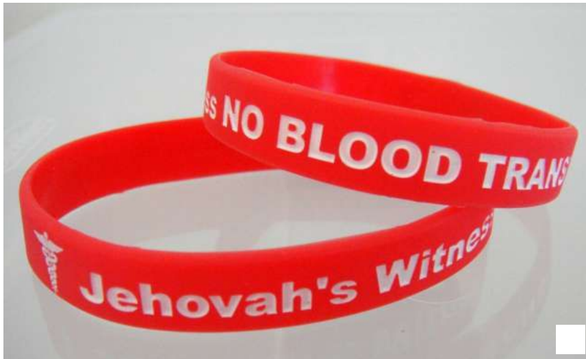
Jehovah's Witnesses are against blood transfusion out of respect for God (ebay)