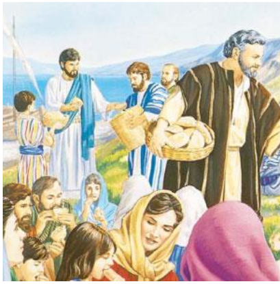
The magazine suggests that Christ's miraculous feeding of the five thousand supports the Governing Body arrangement

importance to Christ than providing physical food, and it was for this reason that Christ chose his apostles.