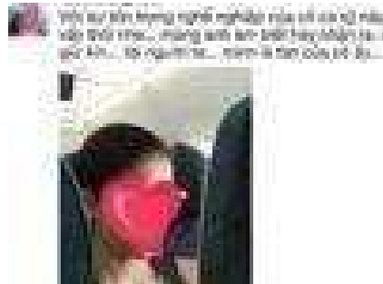
Passenger shamed over shocking mile-high act