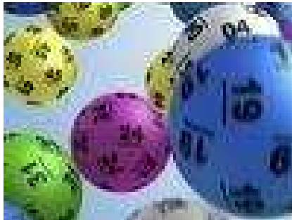
Search on for $50m Powerball winner